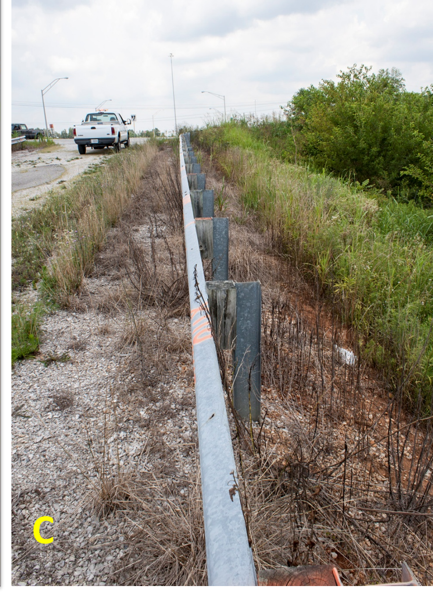
Figure 2. Overall views of Rep 1 (A) and Rep 3 (B) of Elizabethtown trial 1 week before spraying (May 16, 2013). View of sprayed plots in Rep 1 (C) and Rep 2 control plot (D) 56 DAT (July 18).